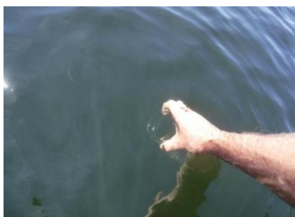
Fig 3- Water sampling

Sampling and analysis was carried out according to Florida Microplastic Awareness Protocol (FMAP) with water samples collected from the subsurface (Fig 3) using 1L mason jars and processed (Fig 4) according to FMAP protocol: http://sfyl.ifas.ufl.edu/media/sfylifasufledu/flagler/sea-grant/pdf-files/microplastics/FMAP-Volunteer-manual-7-24-17.pdf