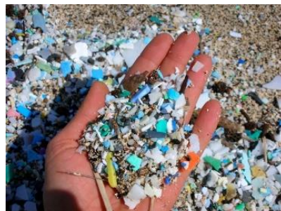
Fig 2- Example of fragments